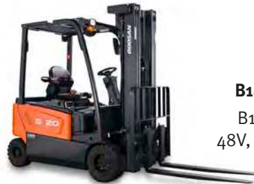
B18X-7 Series B16/18/20X-7 48V, 4 Wheel truck