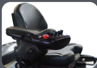
Fully Adjustable Suspension Seat