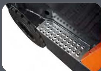
Three-Point Entry/ Exit System