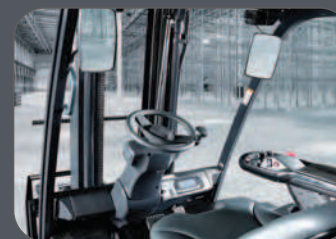
Complete Operator Comfort & Convenience