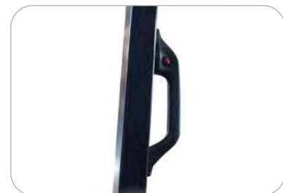
Rear Grab Handle Adds to safety, comfort and convenience when traveling in reverse.