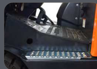
Large Open Floorplate, Increased Leg Room