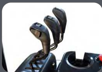
Ergonomic Placement of Hydraulic Controls

Gen 2 Finger-tip Controls: Advanced ergonomics provide optimal performance. These fast, precise and instinctive controllers make operating the Doosan 7 Series effortless and efficient.