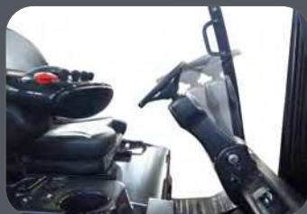
Fully Adjustable Steering Column

Operators perform best when they are comfortable in their working conditions, and the Doosan 7 Series has been designed to make this a reality. The steering column, full suspension comfort seat, armrest and even the optional headrest are all fully adjustable to accommodate any operator's individual preferences. All of the control functions and displays are thoughtfully arranged for maximum comfort. In addition, operators can control the truck's performance settings during operation, simply by navigating the instrument panel. The Doosan finger-tip control system and the mechanical hydraulic levers enable the easiest operation imaginable.