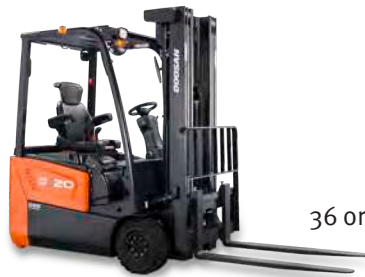
B18T-7 Series B15/18/20T-7 36 or 48V 3 Wheel Truck