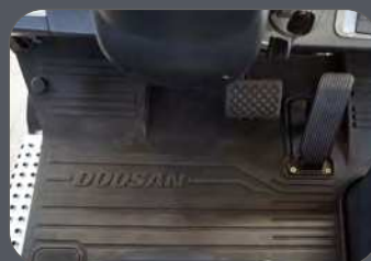
Fatigue Reducing Floor Mat