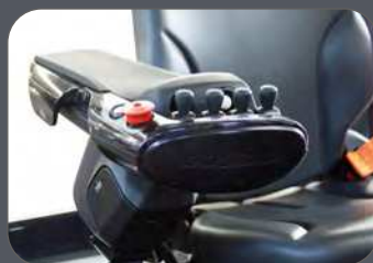
Advanced Fingertip Controls (Option)