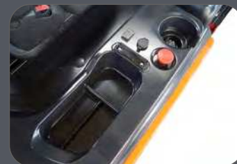
Operator Convenience Tray