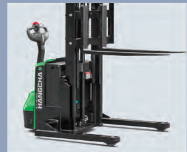
The pump motor's controller offers proportional lowering. This gives the operator precise control and stability when lowering goods.