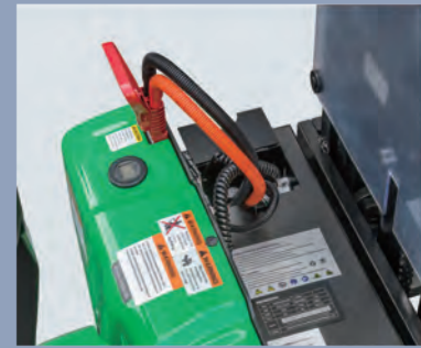
Features a Built-in 50Ah Charger and Maintenance-Free Battery.