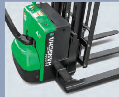
The compact body and rounded design give the pallet truck an ideal footprint for operation in narrow spaces.