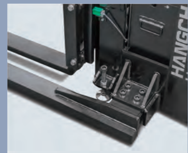
Fixed Straddle Baselegs ( Inside Dimension in 4" increments from 38" to 50") Optional Adjustable baselegs opti fit a wide range of pallet sizes.